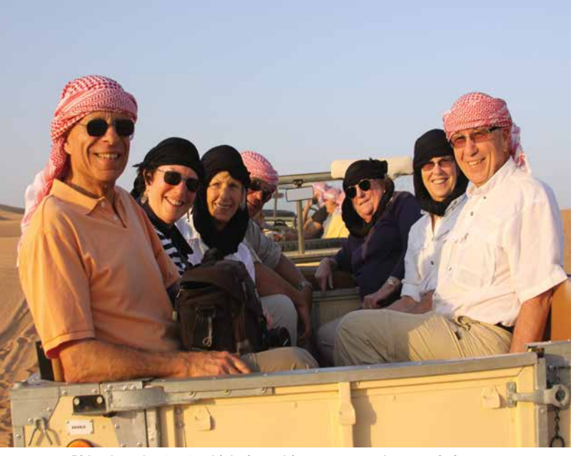
Ride aboard a 4 x 4 vehicle for a drive out to our desert safari

part of a popular sport. Learn more about their revered status on a tour of the Abu Dhabi Falcon Hospital, the most advanced of its kind in the world, before visiting the future at Masdar City. A zero-carbon village, Masdar City is making huge strides in renewable energy and urban planning. Ride aboard a lithium battery car that flows on magnetic tracks to the center of the city for a walking tour. Enjoy an ocean-fresh lunch in the middle